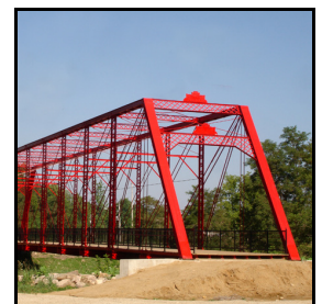
Charlotte Hwy Bridge