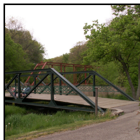
20 Mile Road Bridge