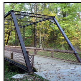
Bauer Road Bridge