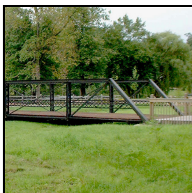
133 Ave Bridge