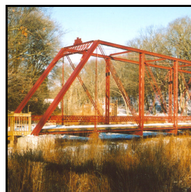
Gale Road Bridge