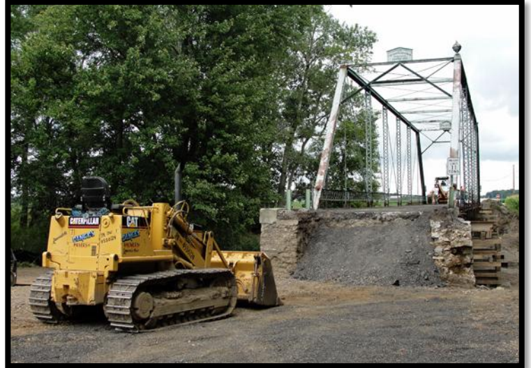
08/24/2009 Township Road 241 removed, south end of bridge