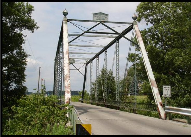
07/18/2007 Township Road 241, south end of bridge