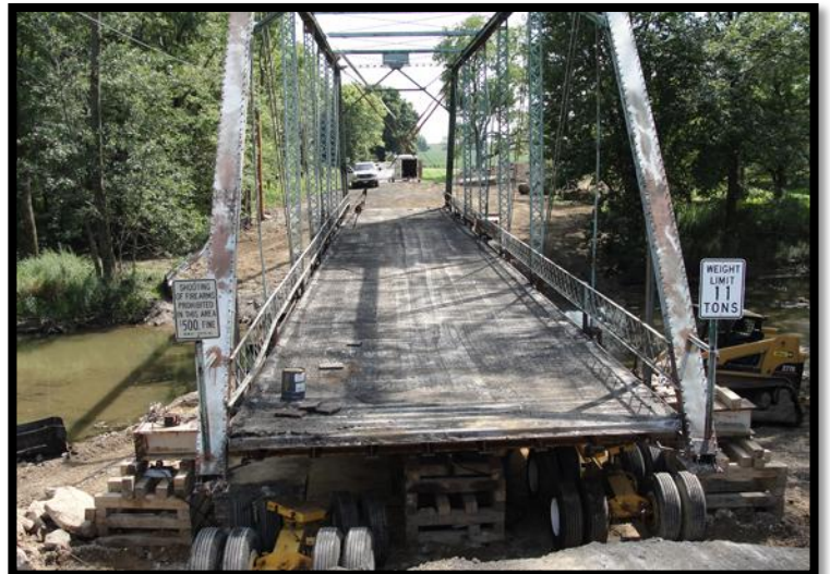
08/25/2009 Township Road removed; North end of bridge placed on dollies