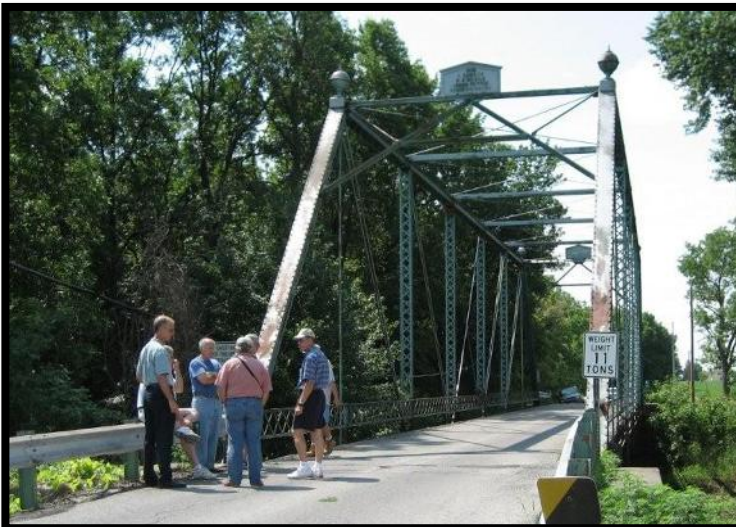
08/16/2007 Township Road 241, north end of bridge