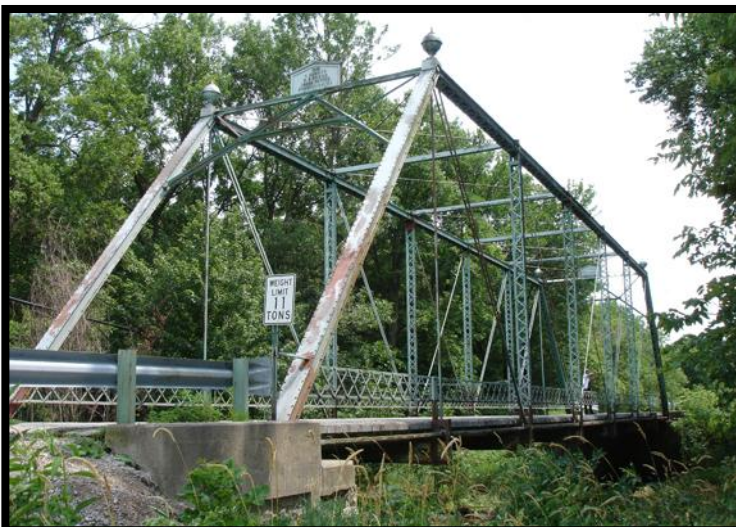
07/18/2007 Northwest corner of TR 241 Bridge